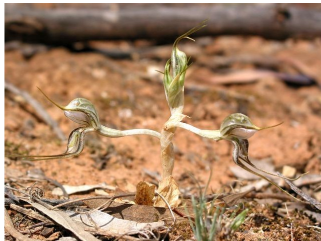
Flowers and buds of Pterostylis despectans .

You can also volunteer your time to assist with surveys, monitoring, weed control, fencing, and other recovery actions for the species.