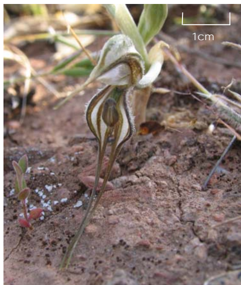
Flower of Pterostylis despectans . J. Quarmby

Pterostylis despectans is an annual, terrestrial orchid. It has 5 to 10 basal leaves forming a rosette flat to the ground, which emerges in winter and is withered by flowering time. It produces a single stout flower stem in late Oct-Dec (2-5 cm tall) with up to eight flowers. The flowers are green with translucent, white and brown stripes. The hood (galea) is up to 15 mm long and has a pointed tip (1 cm long). The lateral sepals are broad with fine marginal hairs and tapering tips (2 cm long) that usually trail on the ground. The lip (labellum) is 5 mm long, dark brown, with fine marginal hairs and two long forward pointing hairs (setae).