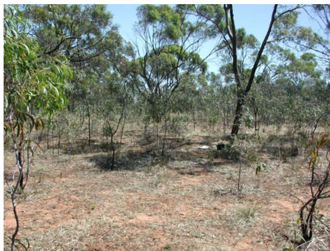
Typical habitat of Pterostylis despectans .

This habitat type has been extensively cleared on the plains north of Adelaide, and remaining fragments are typically small, isolated and often degraded.