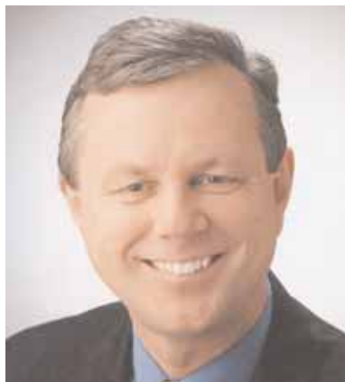
The Hon. Mike Rann, MP Premier of South Australia