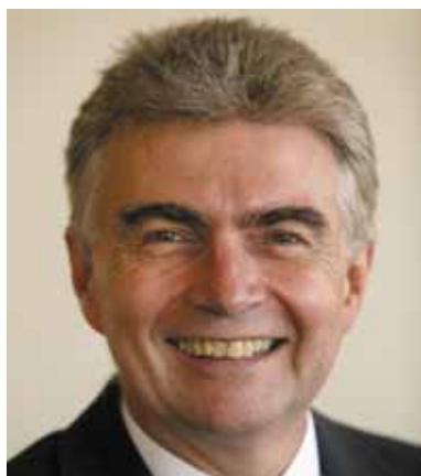
The Hon. John Hill, MP Minister for Environment and Conservation

South Australia's coastal, estuarine and marine environments are a valuable and fragile community resource. Our oceans sustain some of the most biologically diverse fauna and flora in the world, with an estimated ninety per cent of these species unique to southern Australia. Effective planning and management is crucial for the protection and conservation of our species and the waters they inhabit.