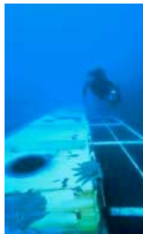
Seawolf port side, 2002.