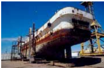
Seawolf on North Arm slip, c2000.

The Seawolf is located 15 metres astern and slightly starboard of the H.A. Lumb . It lies on its starboard side with the bow inside the Noarlunga tyre reef.