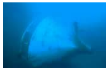
Seawolf bow, 2002.