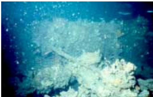
Saurian , c1990s

The two metal barges were coal loaders of the Telfor design. They were unnamed, but marked I and II. The barges measured 70.5 feet (21.5m) in length, 49.2 feet (15m) width and 11.5 feet (3.5m) depth.