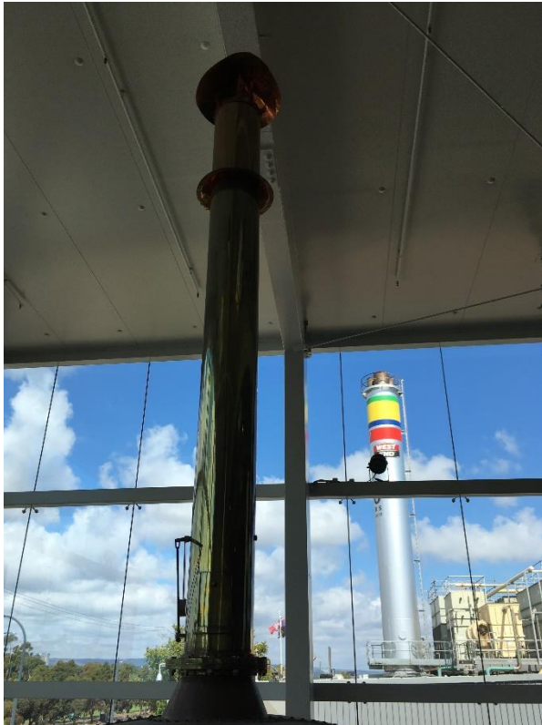
Detail showing the chimney of the copper kettle.