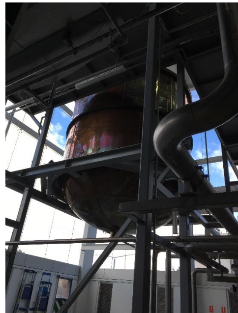
Copper kettle, showing riveting and rounded base.