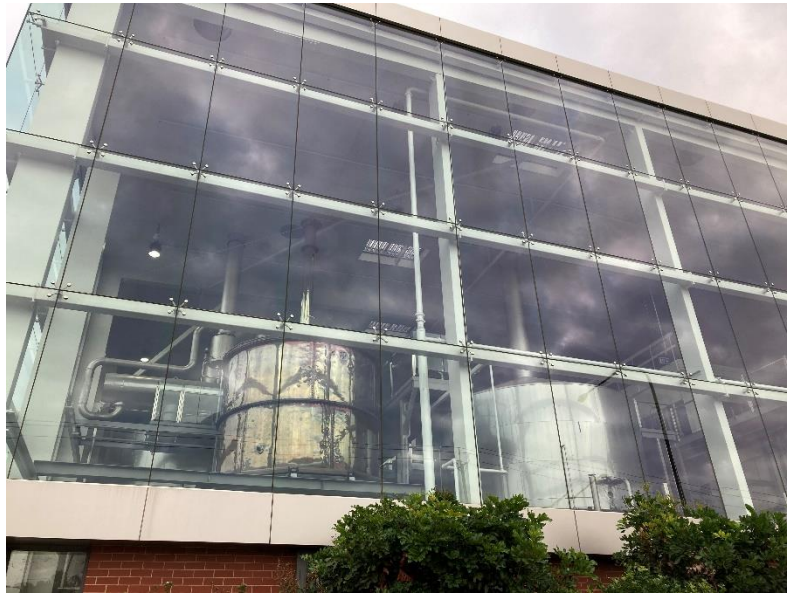
Copper kettle as seen from Port Road in the modern brewhouse West End Brewery Source: DEW Files 21 April 2021