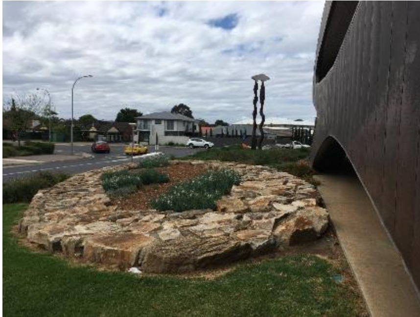
'O' formed from roughhewn rocks, cemented in place.