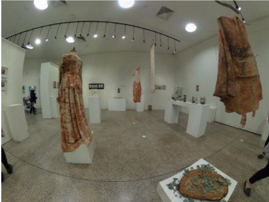
Gallery space at the Marion Cultural Centre