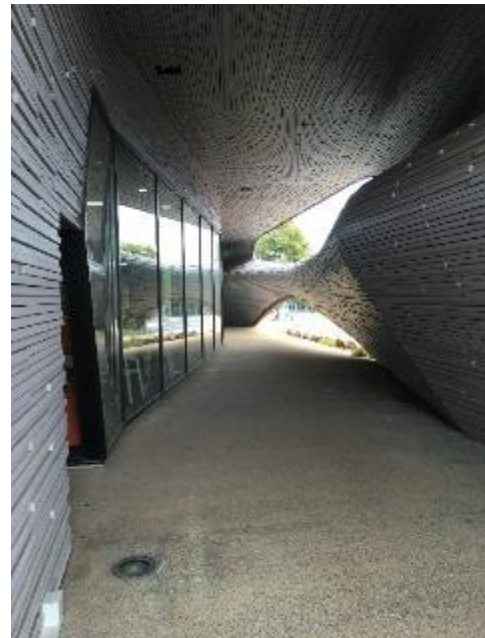
Passageway created down the side of the building by the extruded R. Note the painted timber batons.