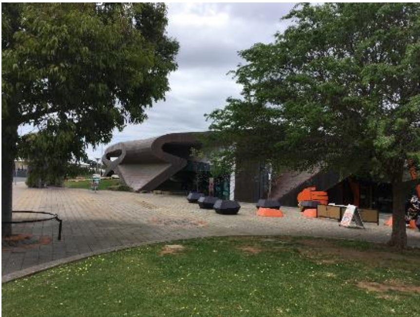
North-western façade showing the extruded R form. Note the copper cladding.