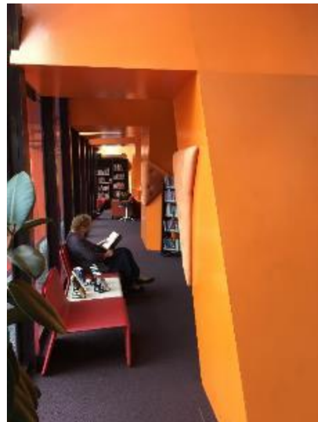
Inside the library showing the MA splicing through and into the building.