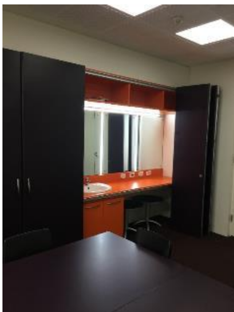
Example of a meeting room that also doubles as a dressing room for the theatre.