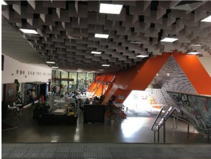
Foyer showing the R form extruded down the side of the building, polished concrete floors, timber baffle to ceiling and café. The gallery is at the far end.