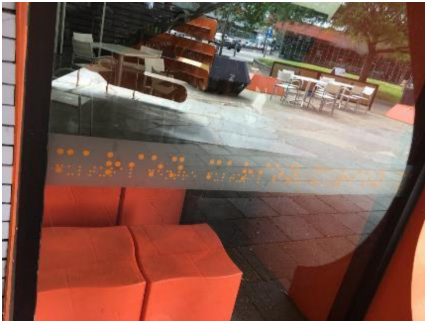
Braille panel extending along the glazing. The large dots denote 'marion', the small dots underneath denote 'cultural centre'.