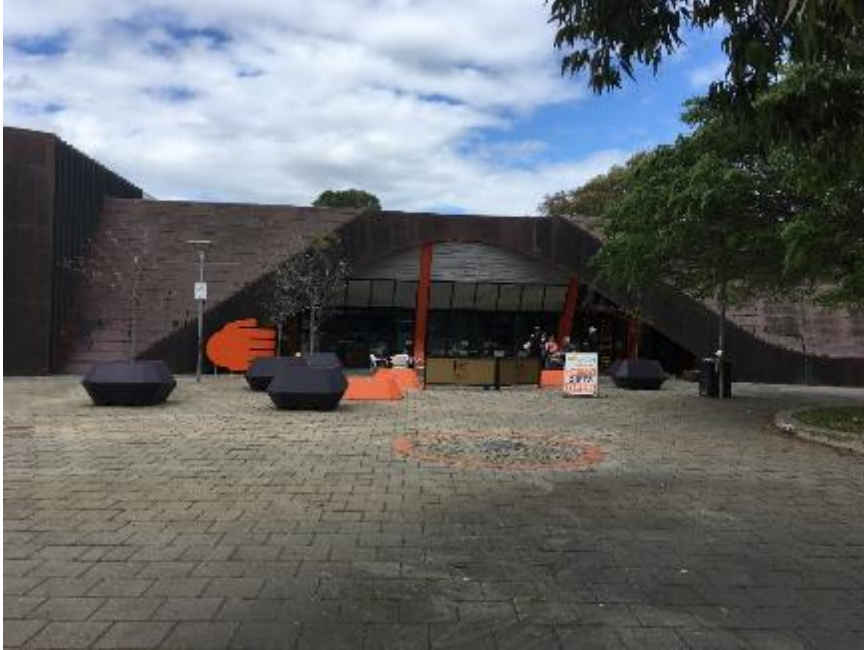
North-western façade showing the courtyard facing the café.