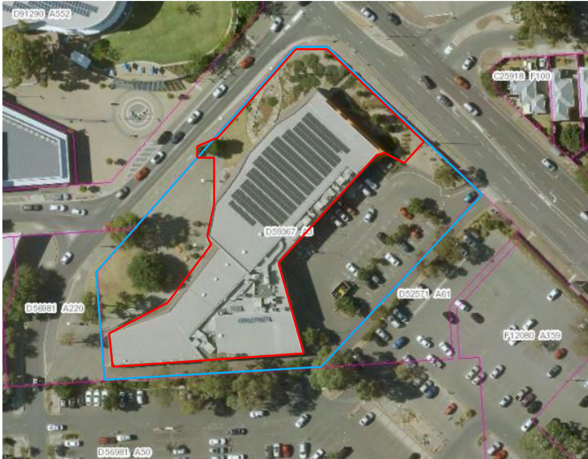
Marion Cultural Centre, Warracowie Way, Oaklands Park, 5046 CT/5880/722 A3 DP 59367, Hundred of Noarlunga