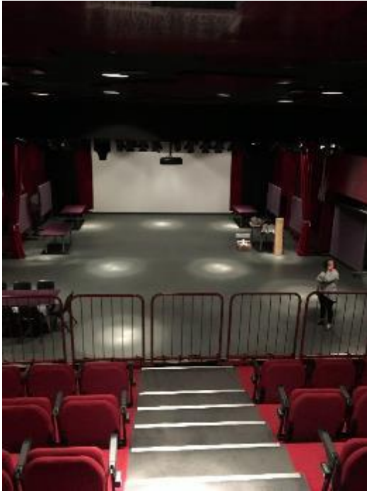
Multi-purpose theatre space.