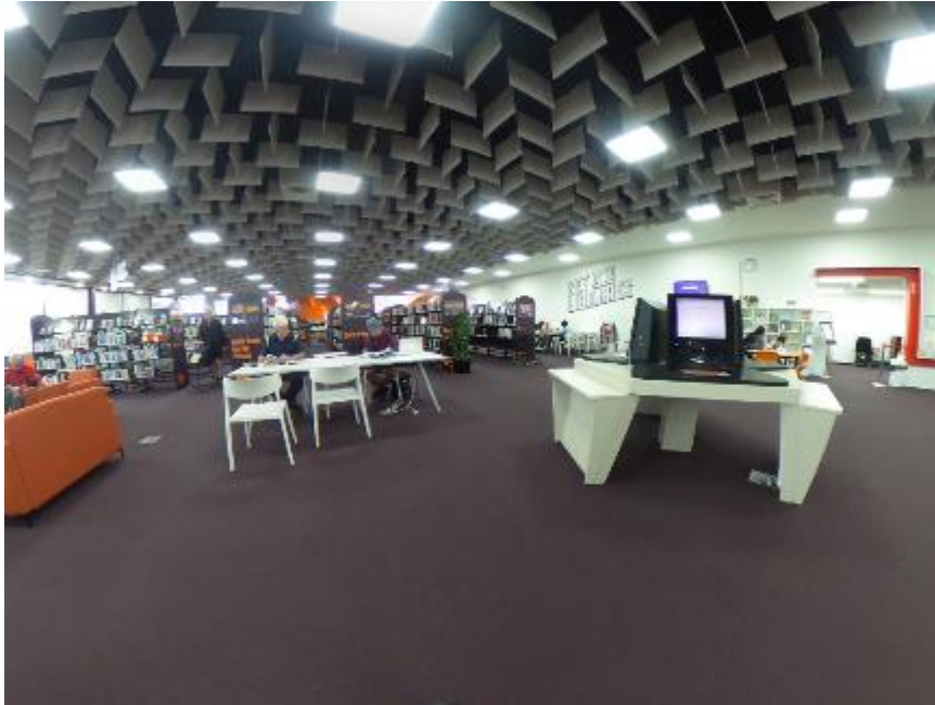
Library at the Marion Cultural Centre.