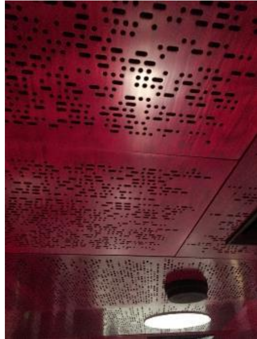
Timber panel ceiling in the theatre, the dots and dashes are words depicted in Morse code.