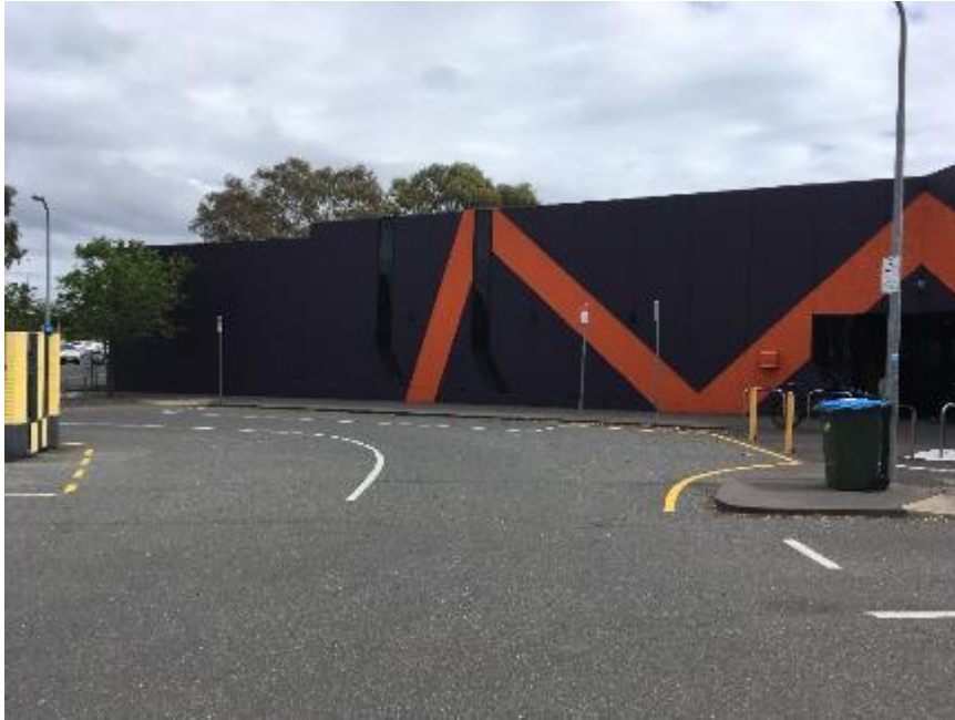
Portion of the eastern elevation showing the concrete panels, M formwork in the panels, windows and secondary entrance into the building.