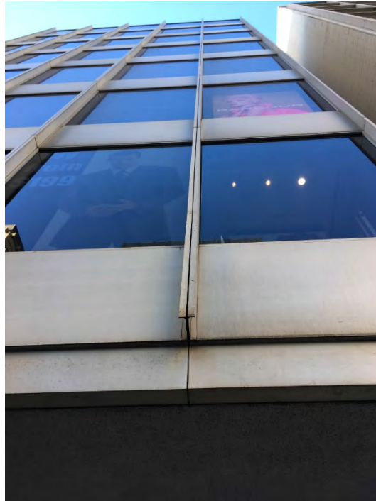
Detail of curtain wall