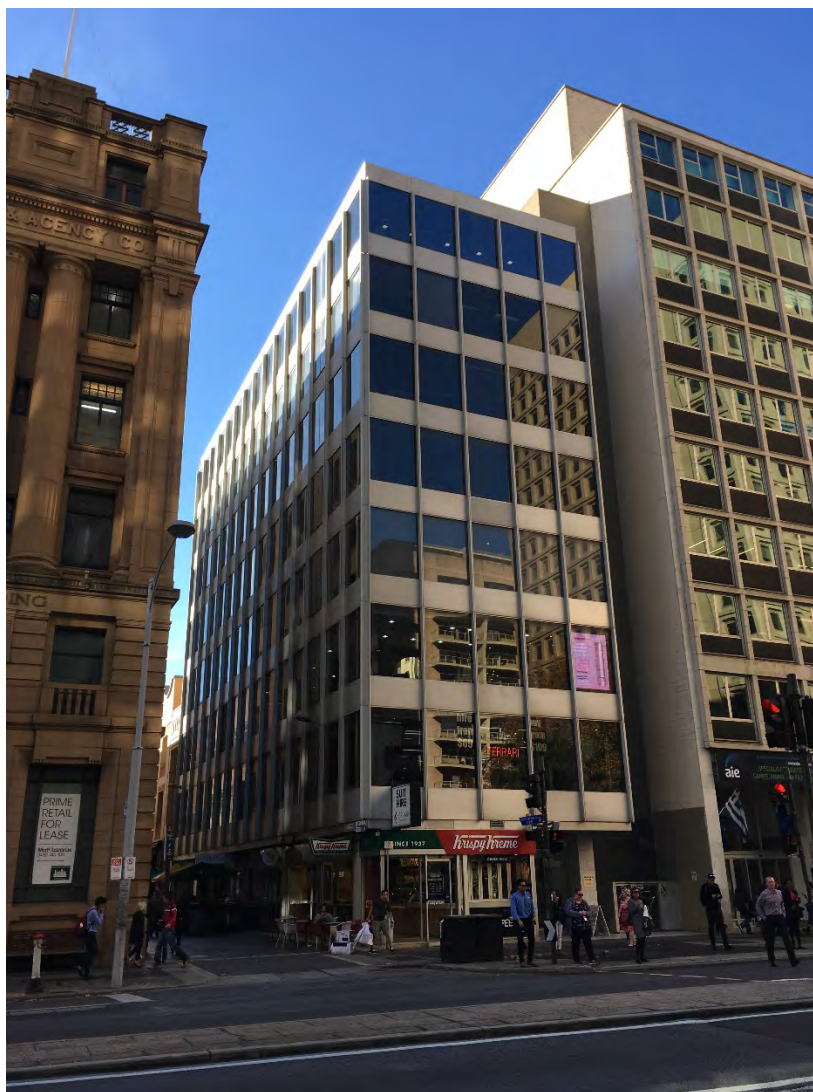
Ferrari House (former Eagle Star Insurance building 1968), 2019