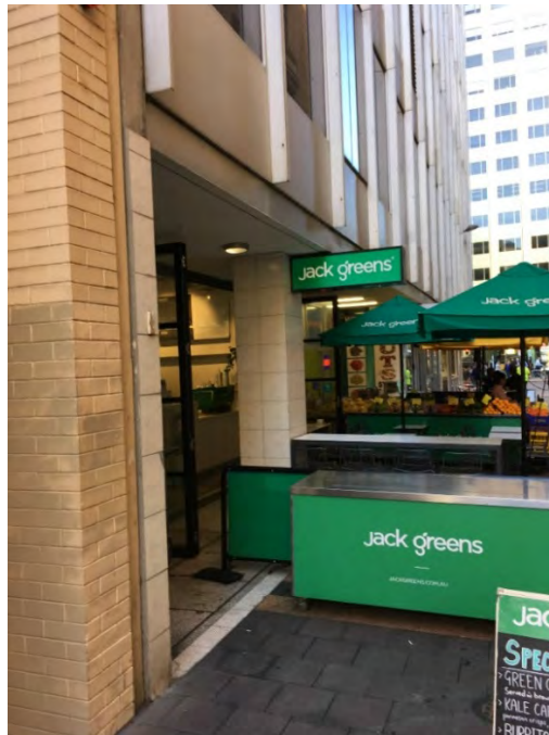
Shop-front to James Place – note original location of curtain wall behind column (this shop front only)