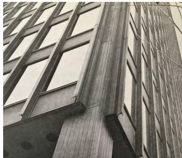
Detail of the curtain wall of the Seagram building note the I-beam mullions