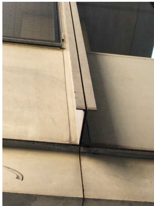
Detail showing formation of 'I' beam, window frame and spandrel