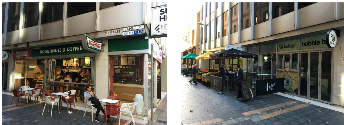
Shop-fronts to James Place (note alignment of curtain wall with columns)