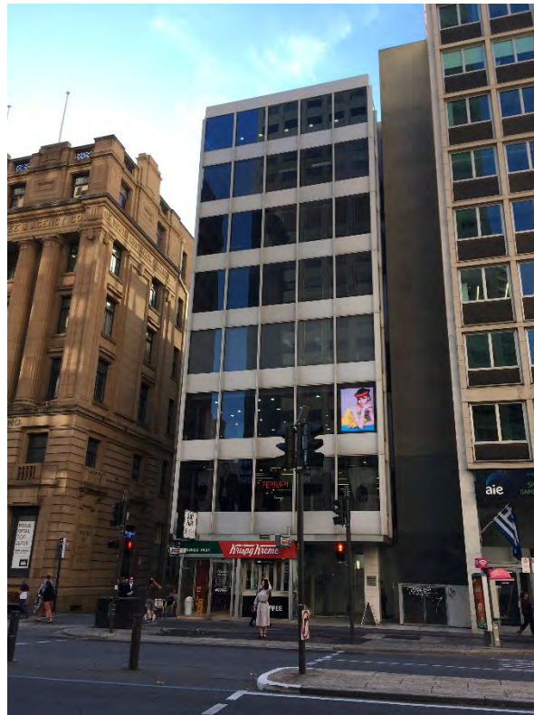
Ferrari House (former Eagle Star Insurance Building) Grenfell St frontage