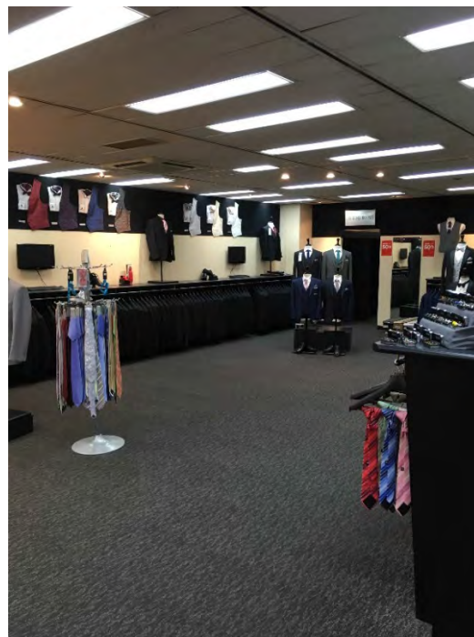
Example of new interior fit-out for shop