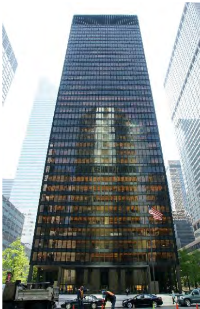
Seagram Building, New York

The Eagle Star building was influenced by Mies van der Rohe's design for the Seagram Building in New York (1954-1958) and followed his tenet of 'less is more'. The Seagram Building is Mies' most well-known commercial building and embodies the culmination of the International Style in the years after World War Two. It is set in a large plaza and is 39 stories high. The ground floor is set back behind the columns of its frame while the 38 floors above are enclosed in an amber-glass curtain wall with extruded bronze I-beam mullions and Muntz metal (a copper alloy) spandrels. The I-beam mullions are a distinctive feature of the building and when combined with the narrow proportioning of the glazing adds to the building's sense of verticality. 14