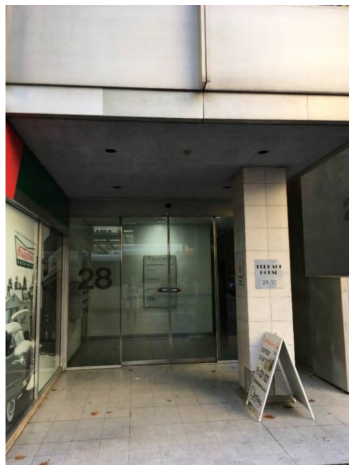
Foyer entrance on Grenfell Street