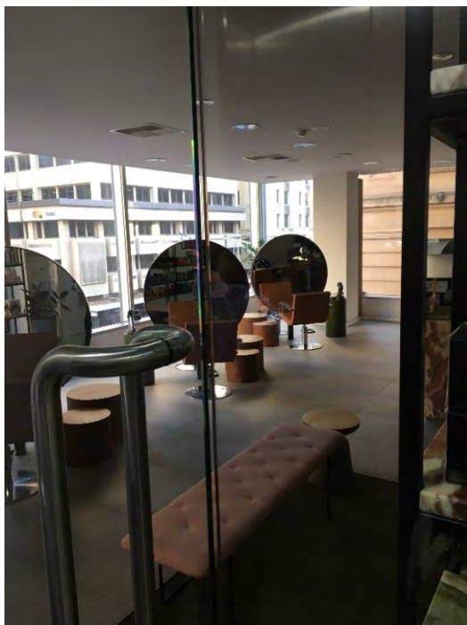
Example of new interior fit-out for beauty school