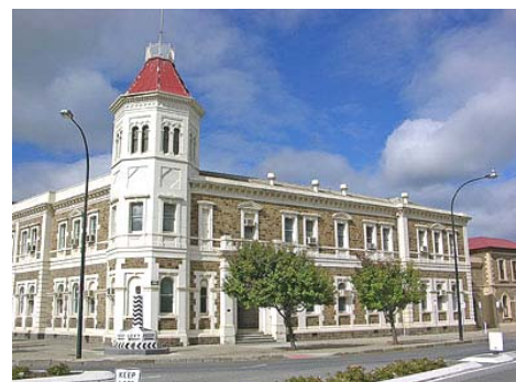
Former Customs House, 2005

At the time the Customs House was built, the South Australian Government collected customs duties on goods landed at Adelaide from the other Australian colonies and from overseas. This was an important source of revenue for the Government, prior to the introduction of direct taxation.