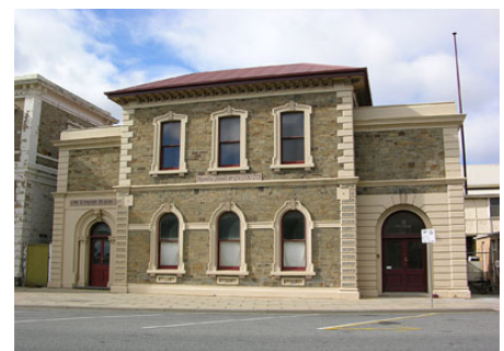
former Telegraph Office, 2005