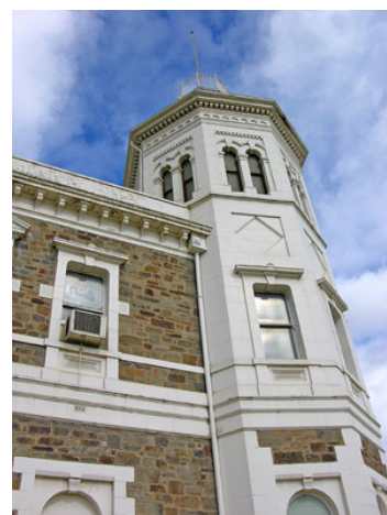
Customs House tower, 2005

The building's exterior has changed little, but the interior has undergone significant alterations over time. The 'Long Room' has been partitioned into smaller offices, and some interior walls have been removed. Suspended ceilings and other timber partition walls have also been added, but most alterations are reversible.