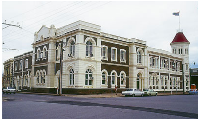
Former Institute & Customs House, 1979

At first glance the former Institute Building (1876) and Customs House (1879) appear to be one building, although closer inspection reveals the obvious differences in design and construction. The two buildings were once separated by a narrow lane, but by 1890 this had been built across to provide extra space for the Customs Service and, in 1959, the two buildings were physically linked by the creation of internal access ways.