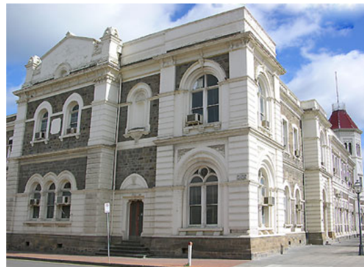
Former Institute Building, 2005

The Port Adelaide Institute was formed in 1859 and was a centre for education and other cultural and social activities in Port Adelaide for over 100 years. It was one of a number of institutes that were established in South Australia in the second half of the nineteenth century to provide adult education for the working class, as well as libraries and other cultural activities.