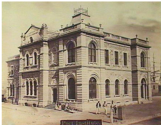
Port Adelaide Institute 1874 Photo B 10740: State Library of SA

This bluestone building contained a residence, a library, reading room, museum, lecture hall, classrooms and committee, lecturer's and curator's rooms. A lookout with balustraded parapet, provided by constructing a mansard roof, is visible on early photographs, but has since been demolished.