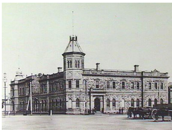
Customs House, Port Adelaide 1910

Initially the Customs Office was accommodated on the ground floor of this building, with the Marine Board on the first floor. A 'Long Room', an integral part of nineteenth century customs houses, was located at ground level and was used for conducting customs' business. The long room was a noisy, bustling place with numerous customs officers processing forms. All paperwork regarding duties payable on cargo was taken there and, after the dues were paid, the Long Room officials issued the receipts that allowed the goods to be unloaded, or collected from the Bond Stores.