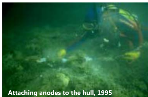
Attaching anodes to the hull, 1995