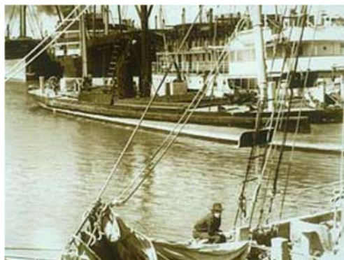
Santiago as a coal hulk, c.1930s

Today Santiago 's mostly intact hull is exposed above the river level. The masts have been cut off and lay next to other fittings lying within the structure and outside the hull. Santiago is the oldest vessel in the Graveyard. It is a rare example of an early iron-built sailing vessel and has been declared an historic shipwreck under the South Australian Historic Shipwrecks Act 1981 .