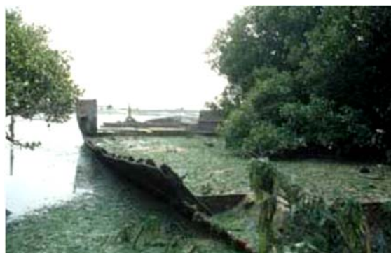
Remains of Flinders at Garden Island