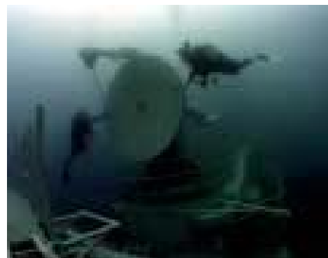
The radar, November 2002