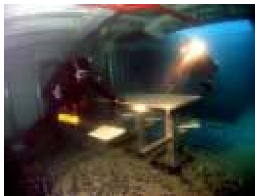
The café, November 2002.