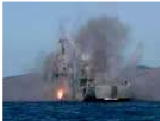
Explosives detonated, November 2002

In June 2000 the decommissioned vessel was gifted to South Australia by the Federal Department of Defence, to become an artificial reef and world-class dive site. Prior to the scuttling preparatory work was needed to ensure safe diving and minimal impact on the environment. This work was based on international best practices and was mostly undertaken at Port Adelaide by contracted labour, although volunteers were also involved.