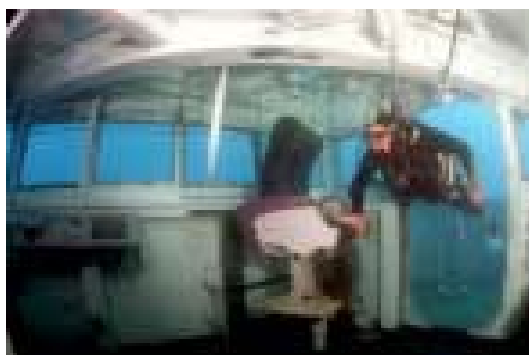
The bridge, November 2002.