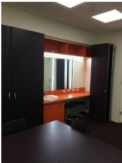
Example of a meeting room that also doubles as a dressing room for the theatre.