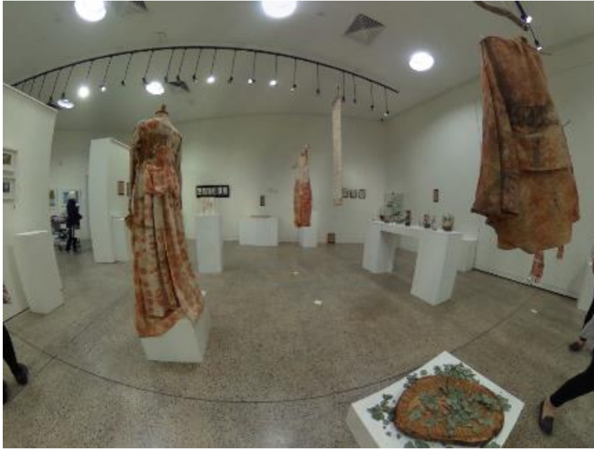
Gallery space at the Marion Cultural Centre