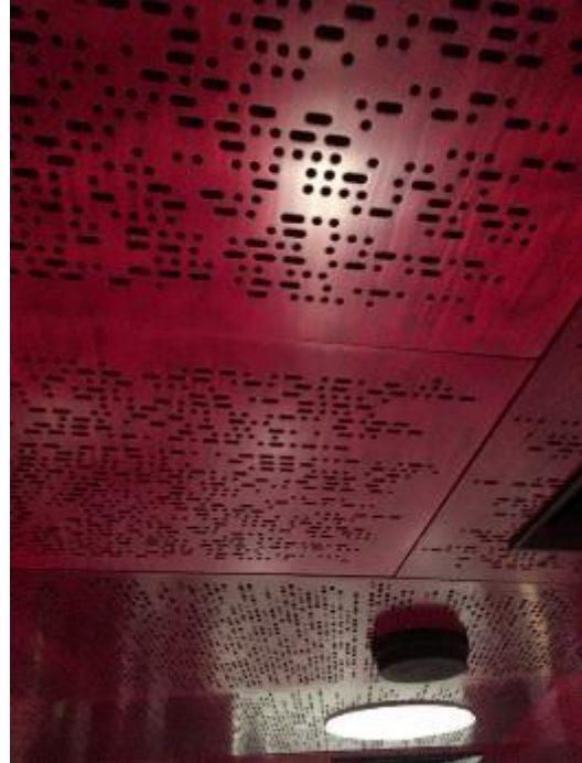
Timber panel ceiling in the theatre, the dots and dashes are words depicted in Morse code.