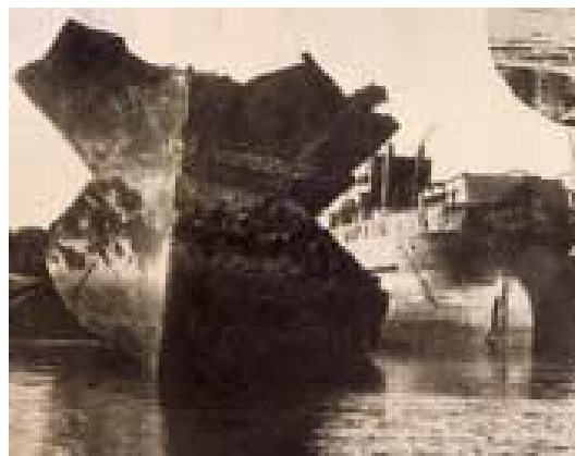
Grace Darling (in background) at Garden Island.

The Grace Darling's career involved a number of minor mishaps, including strandings, flooding, a collision and a potentially serious engine room fire at the Port Adelaide wharf. On 19 June 1931, after 23 years of service, the steamer was abandoned at Garden Island amongst the other derelicts in the Ships' Graveyard. Today its extensively salvaged remains lie predominantly amongst the mangroves.