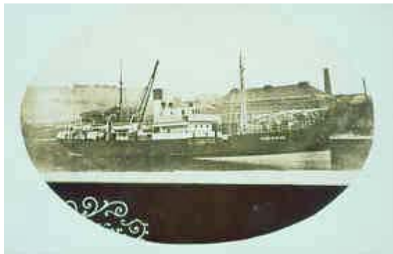
Grace Darling , c1900s.

Following its arrival at Port Adelaide in 1908, the Grace Darling was employed in the coastal trade, primarily as a passenger vessel, but also carrying general cargo and at times acting as a tug and a wheat lighter. The majority of its voyages were in South Australian waters, but it also journeyed interstate.