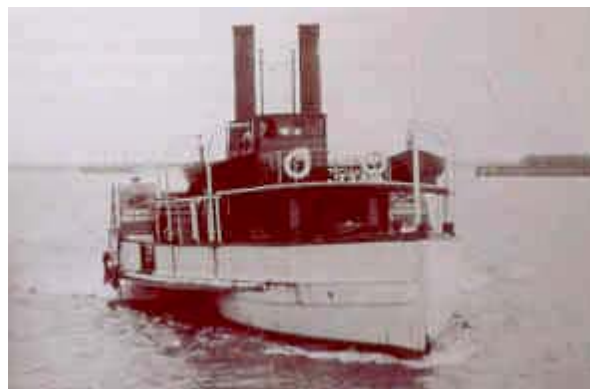
Gem in Hobson's Bay, Victoria.

With the widening of No 2 Dock, the Gem was removed on 19 July 1927 and laid up, before being towed to Garden Island. It was later sold and broken up for firewood. Today the most visible remains are the timber keel, stem and sternpost.