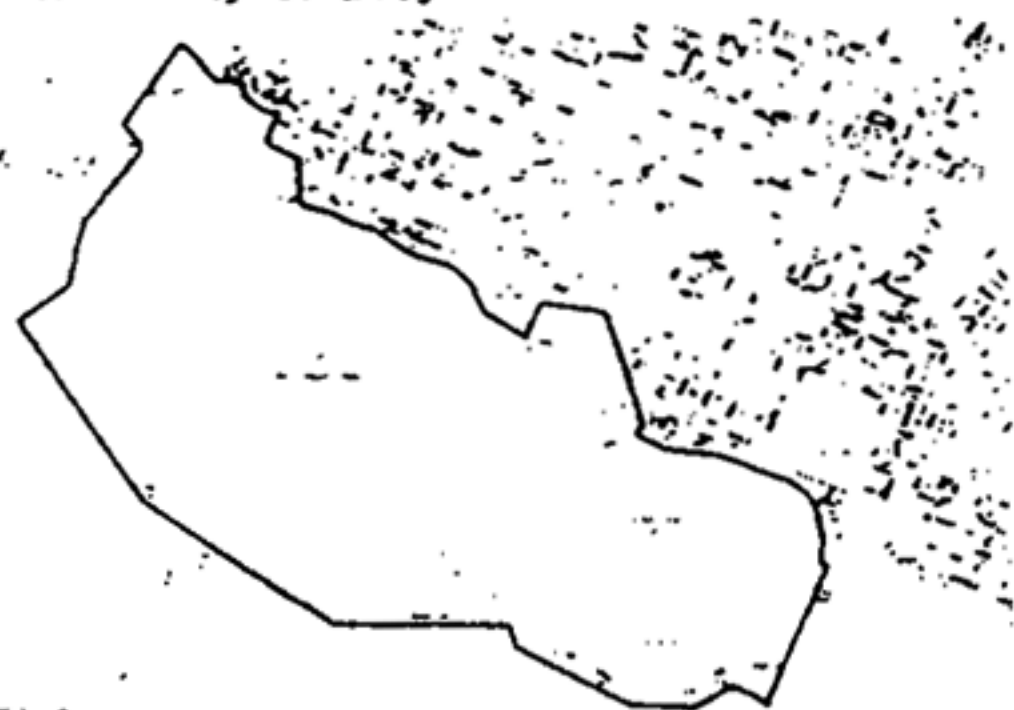
Mt Gambler Volcanic Complex State Heritage Area

All that land being sections B, C, 857, 241, 591, 242, 220, 373, 391, 90, 892 and 894, part sections BK853, the eastern portion of sections 855 and 856, the western portion of section 478, the southern portion of sections 239 and 851, allotments 20, 21, 22, 23, 25, 26 and 32 in part sections 854 and 855 of deposited plan 11278, allotments 15, 16, 17, 18, 19, 27 and 28 in part section 855 of deposited plan 11277, part allotment 6 of part section 851, the north-eastern portion of section 10, the northern portion of sections 11 and 13, and the north-western portion of section 14, hundred of Blanche, County of Grey.