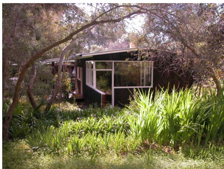
View of the Dickson House from the south-east

In 2008-09 five State Heritage Places were provisionally entered in the Register and one provisional entry was confirmed. The confirmed entry was especially significant in terms of the State's post-war domestic architecture, and is detailed below. All other activities are detailed in Appendix A. There were 2,208 confirmed entries in the Register at 30 June 2009.