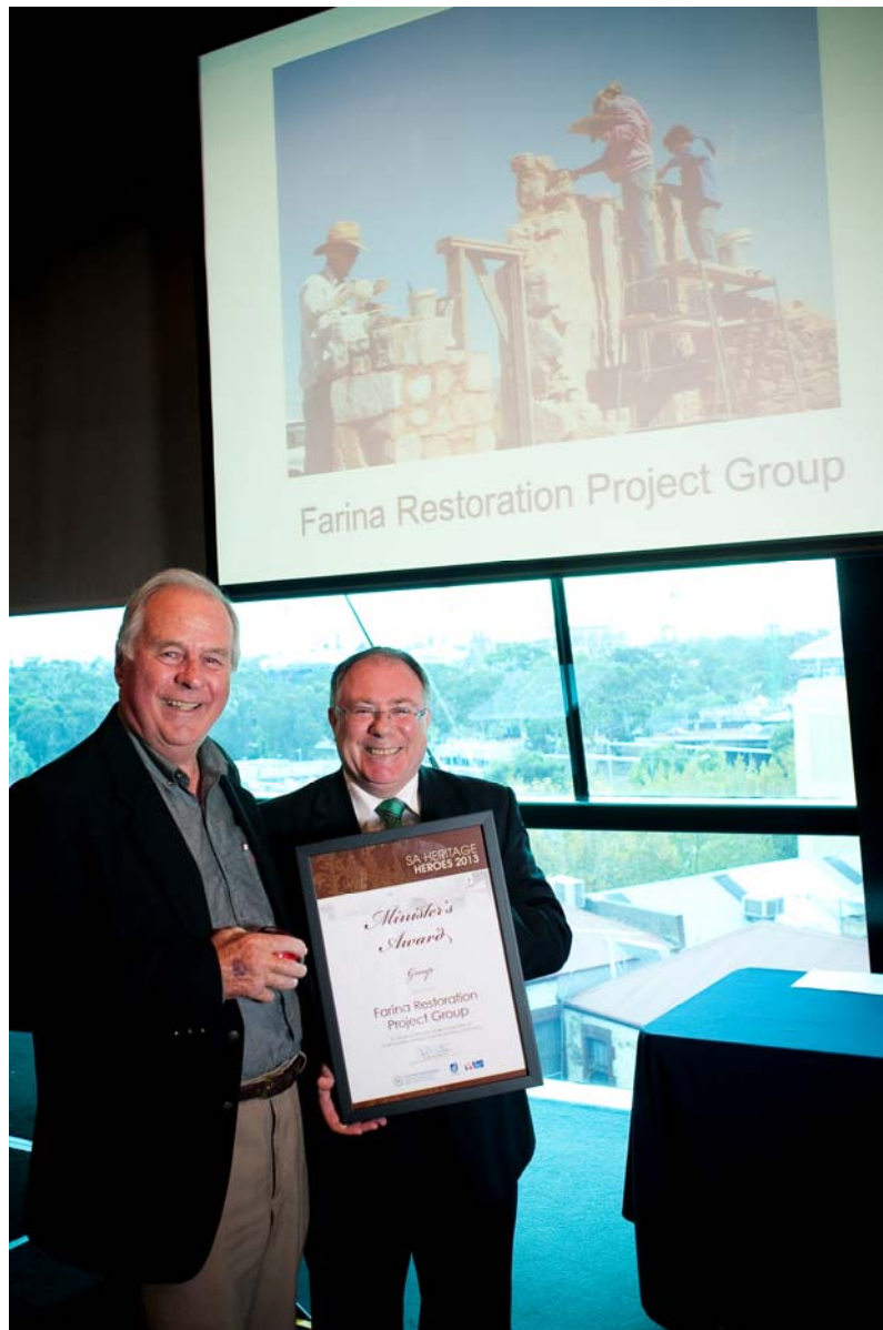
Heritage Heroes 2013 Minister's Award (Group Category)

[Representative of Farina Restoration Project Group and Minister for Sustainability, Environment and Conservation, Hon Ian Hunter MLC]