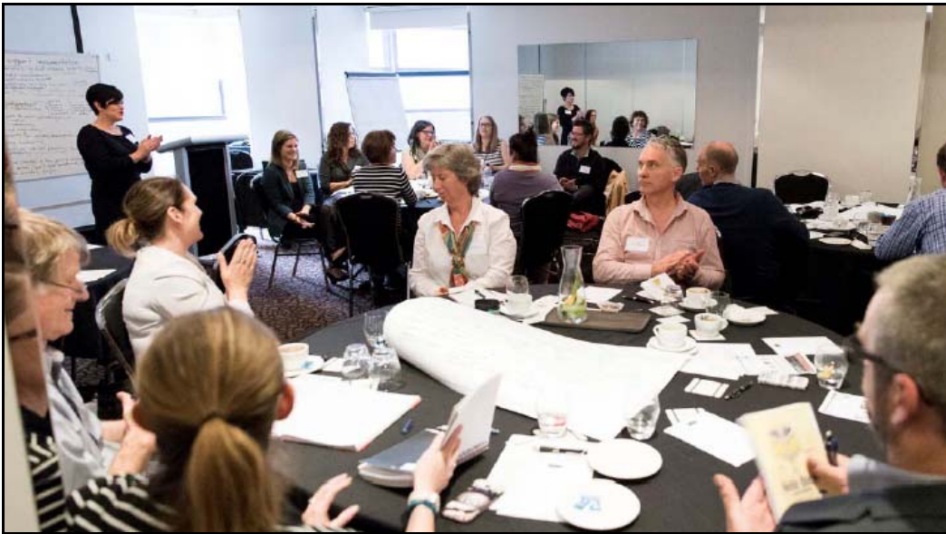
The Regional Adaptation Discussion Forum hosted by the Premier's Climate Change Council and the Department of Environment, Water and Natural Resources (May 2016).

Forum participants identified a number of initiatives and actions to sustain momentum in regional adaptation planning and action. In summary, suggestions related to the development of a state-wide communications strategy about climate change adaptation; exploring policy and regulatory levers to embed the consideration of climate change in planning and decision-making; taking a whole-of-government approach to implementing adaptation actions; identifying sustainable funding mechanisms for adaptation; using media channels to celebrate adaptation achievements. Participants supported having regular conversation across the regions to share experiences and lessons learned, and to support cross-regional collaboration. The discussion also highlighted the importance of regional adaptation coordinator positions to drive sustained action in a region.