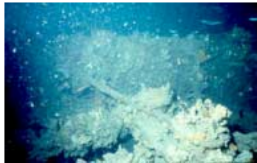
Saurian , c1990s

The two metal barges were coal loaders of the Telfor design. They were unnamed, but marked I and II. The barges measured 70.5 feet (21.5m) in length, 49.2 feet (15m) width and 11.5 feet (3.5m) depth.