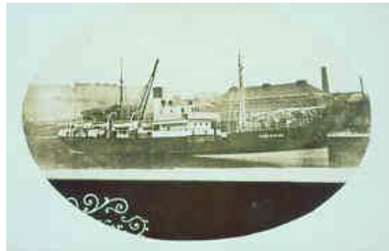
Grace Darling , c1900s

Following its arrival at Port Adelaide in 1908, the Grace Darling was employed in the coastal trade, primarily as a passenger vessel, but also carrying general cargo and at times acting as a tug and a wheat lighter. The majority of its voyages were in South Australian waters, but it also journeyed interstate.