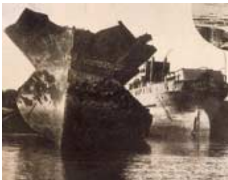
Grace Darling (background) at Garden Island, 1933

The Grace Darling's career involved a number of minor mishaps, including strandings, flooding, a collision and a potentially serious engine room fire at the Port Adelaide wharf. On 19 June 1931, after 23 years of service, the steamer was abandoned at Garden Island amongst the other derelicts in the Ships' Graveyard. Today its extensively salvaged remains lie predominantly amongst the mangroves.