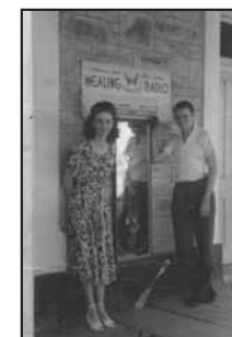
Local identities at Royal Victoria Hotel