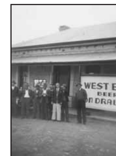
Beltana Tennis team at Royal Victoria Hotel c1940