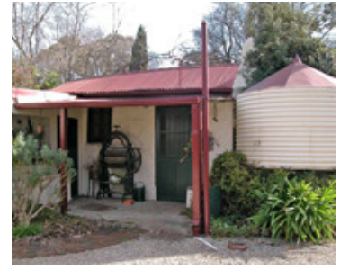
Rear entrance August 2005

At some stage a second room was added at the front and then a timber-framed partition erected in both rooms, thus dividing two rooms into four. This front extension included a symmetrical masonry chimney and a hipped roof. The foundation of the addition was higher than the original building and changed the floor levels, with a step up to the new section. Later the western wall of the new front section was demolished and a timber-framed extension built to enlarge the space. Later again, another timber-framed extension, containing bedroom, laundry and bathroom was added at the rear.