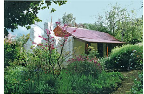
Primrose Cottage, 2005

'Primrose Cottage' was built by William Scott, and is noteworthy as the first dwelling constructed in Kersbrook after the completion of the Town survey in 1858.