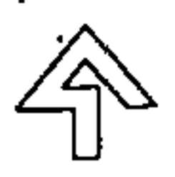
Figure 1 MORGAN CONSERVATION PARK Park Features and Concept Diagram