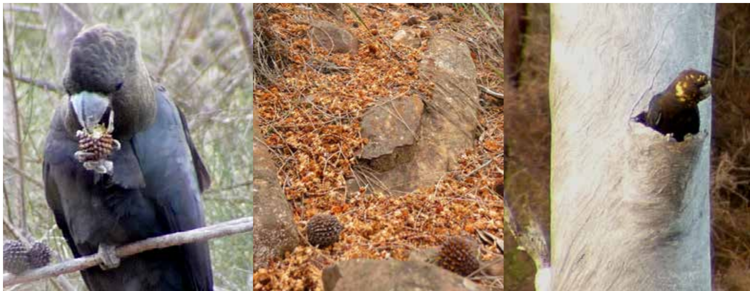
Images left to right: Male glossy feeding. Sheoak cone chewings. Nest in hollow. Young chick in artificial nest. Possum in nest. Banded fledgling.