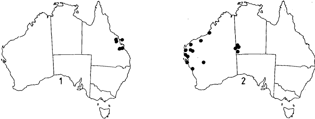
Map 1. Ehretia grahamii Randell. Map 2. Trichodesma zeylanicum var. grandiflorum Randell.

NORTHERN TERRITORY: Petermann Ras., at crossing of Docker River road with Docker R., just E of township, M.G. Corrick 10405, 23.vii.1988 (AD, CANB, DNA.)