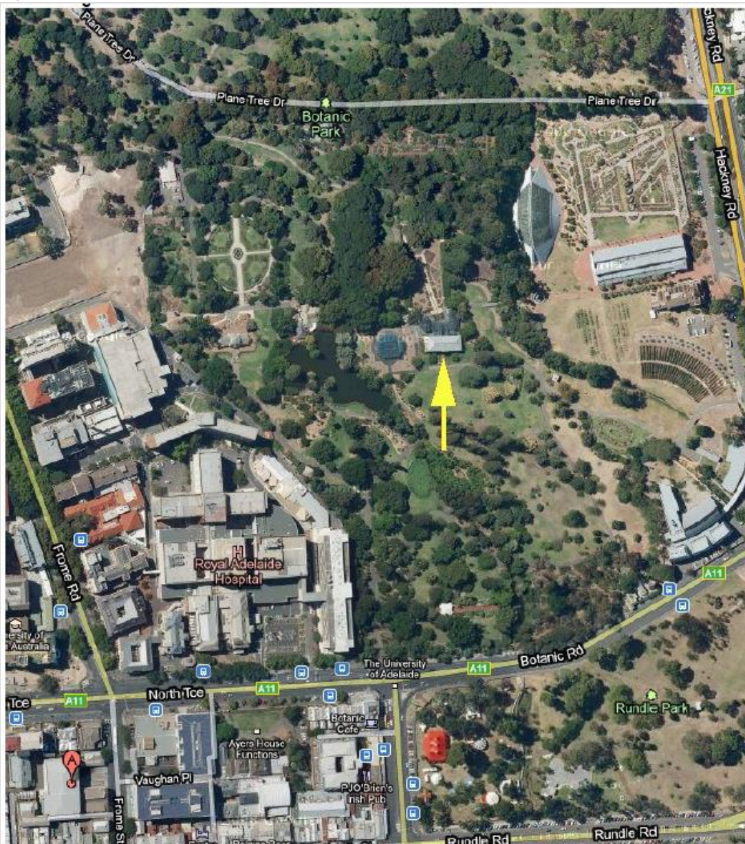
Location of the Museum of Economic Botany in the Botanic Gardens, indicated by an arrow (Google Maps).