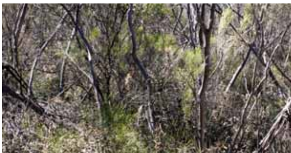
Typical Western Whipbird habitat

A regional Recovery Plan is in place for a group of mallee birds, including the Western Whipbird. Surveys will help to establish its distribution and better define its habitat requirements. Its needs will then be incorporated into Park and Fire Management Plans, with important areas being protected from threats.