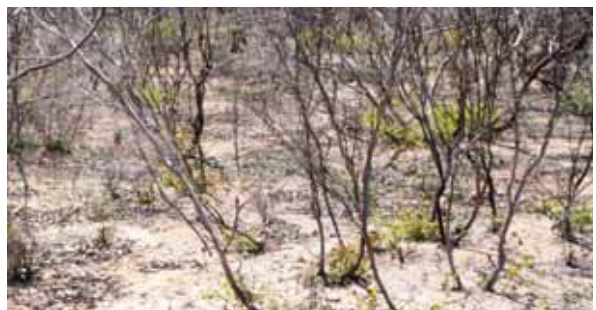
Western Whipbird habitat 9 months after a wildfire.

If you see or hear a Western Whipbird, record the time, date and exact location and report it to the Regional Ecologist, DEH Murraylands, Ph (08) 8595 2111. Every record is extremely valuable.