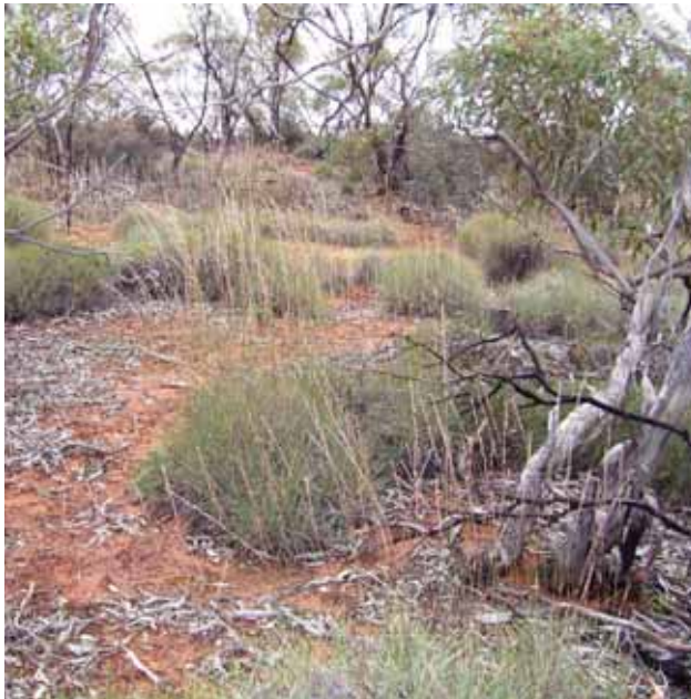
Striated Grasswren habitat at Cooltong Conservation Park

A lot of grasswren habitat was cleared during the last century, which not only greatly reduced their population size, but also left them scattered in isolated remnants across the landscape. These isolated populations face greater risks of decreased genetic health and of being lost to wildfires, as there may be no way for them to move between habitat patches. Fire and drought acting together in a fragmented and degraded landscape are this species' largest threats. Illegal trapping for the aviculture industry is a localised problem and could heavily impact smaller populations.